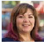
District 41: Linda Sánchez