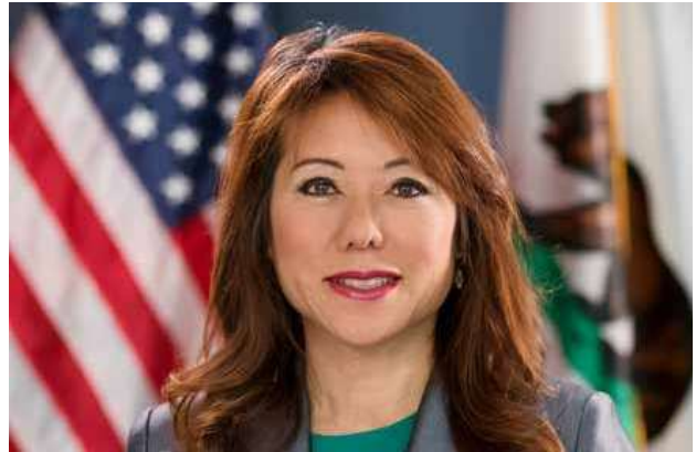
LT. GOVERNOR: FIONA MA