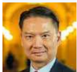
District 70: Tri Ta