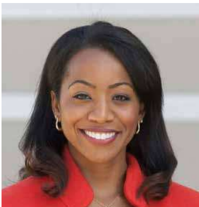
CONTROLLER: MALIA COHEN (INCUMBENT)