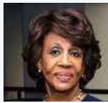
District 43: Maxine Waters