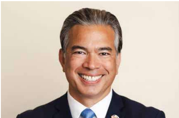
ATTORNEY GENERAL: ROB BONTA (INCUMBENT)