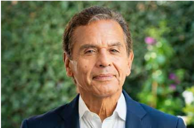
GOVERNOR: ANTONIO VILLARAIGOSA