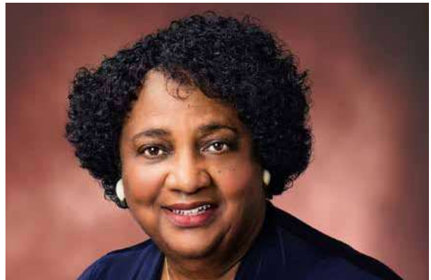
SECRETARY OF STATE: SHIRLEY WEBER (INCUMBENT)