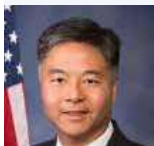
District 36: Ted Lieu