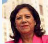
District 38: Hilda Solis