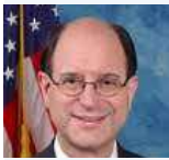
District 32: Brad Sherman